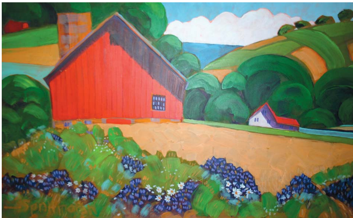
The Passage / 2008 acrylic on board, 24 x 48 in.