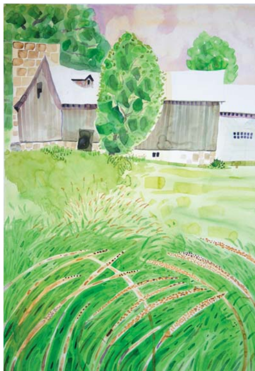
Marsh Grass / 2006 acrylic on paper, 22 x 30 in.