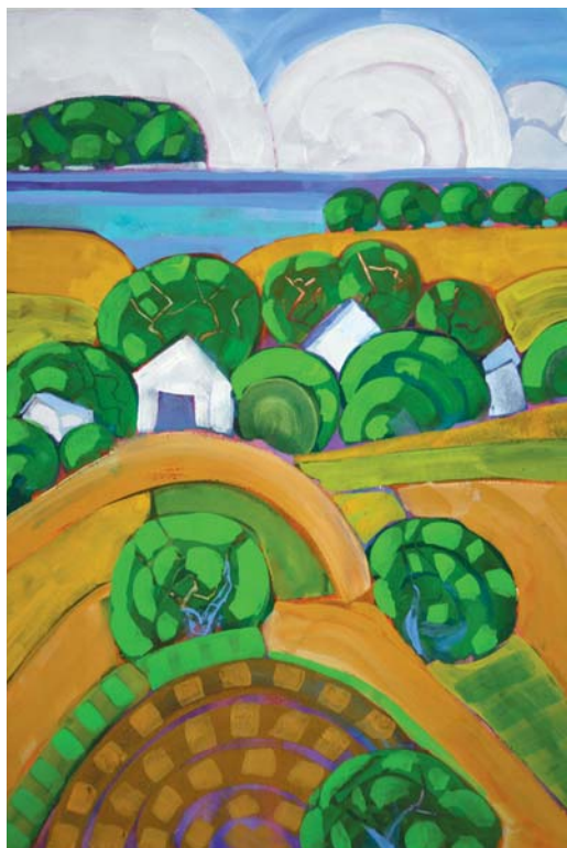
Even the Horizon is Curved / 2008 guache on paper, 22 x 30 in.