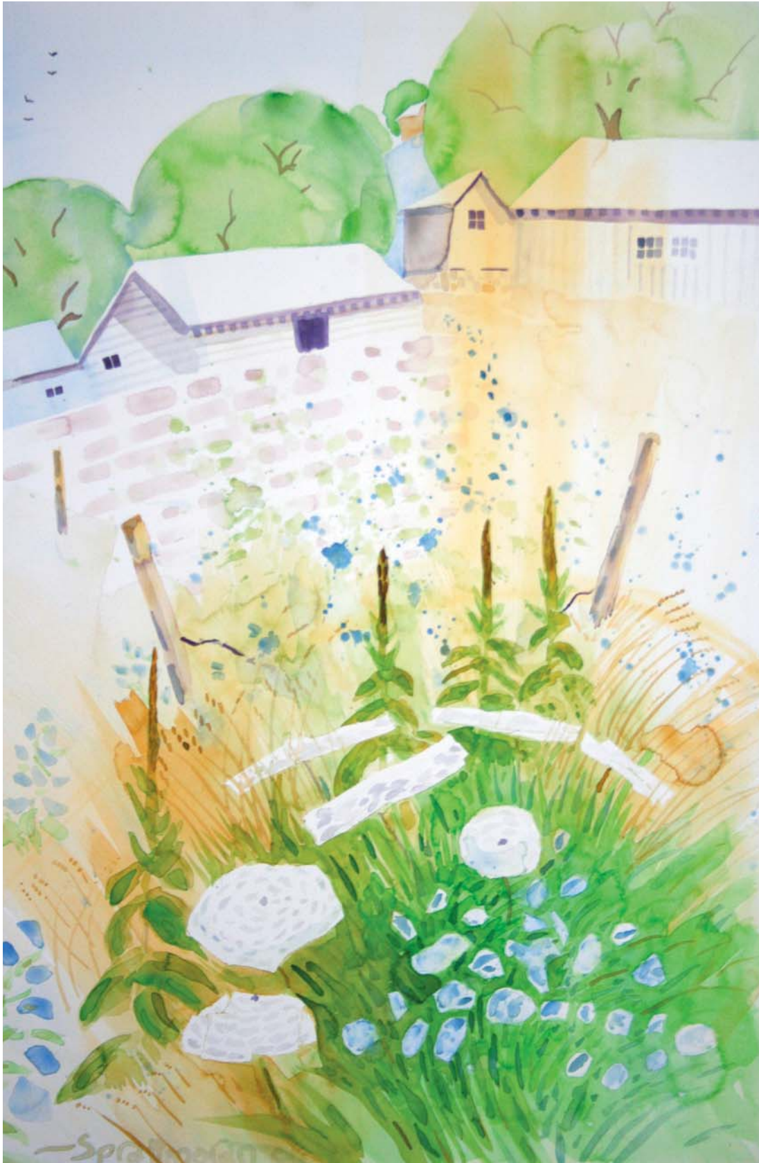
Queen Anne's Lace / 2005 watercolor on paper, 22 x 30 in.